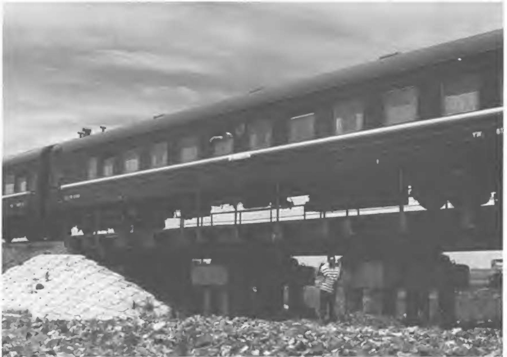
Figure 1. A saker nest 2 m from the ground on an active railroad trestle.

furnished by Upland Buzzards. At one of these, we found two saker eggs (one dimpled but sloshy and a second egg crushed and being consumed by dermestid larvae) beneath about 10 cm of recently added sticks. At the second nest, we found large, bright (not faded) eggshell fragments beneath about the same depth of sticks. The lack of fresh whitewash at egg level in both nests suggested that neither pair of sakers had hatched or fledged young.